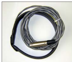
Rogowski Coil (S6)