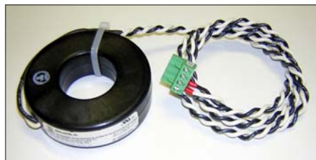
Primary Coil (P5)