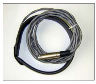
Rogowski Coil (S6)